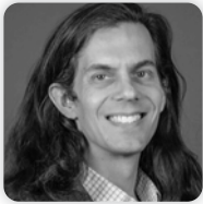
LEAD AUTHOR Kyle Chilton

Performance scores may change significantly when additional organizations are interviewed, especially when the existing sample size is limited, as in an emerging market with a small number of live clients.